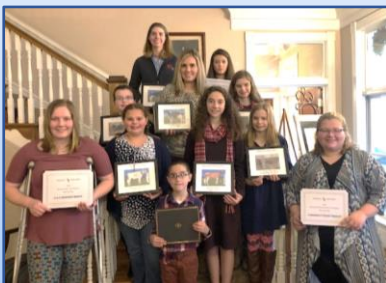
2018 All-Virginia Winners