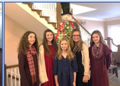
2019 Junior Association Board

Visit the website for more pictures and results from the 2018 Annual Meeting.