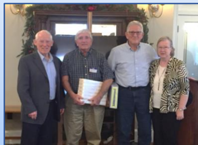
2018 Meritorious Service Award